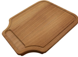
Iroko-wood chopping board 8647 000