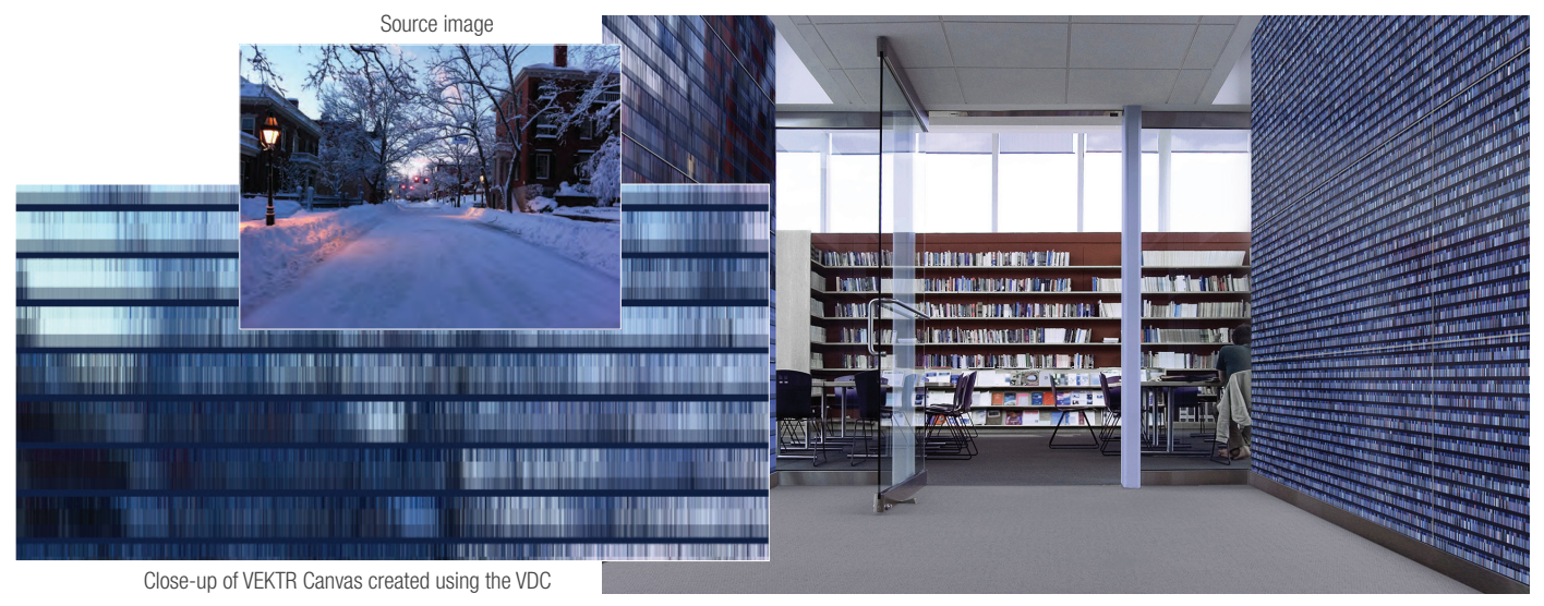
ViviSpectra VEKTR glass installation example

Usage rights, permissions, and/or copyrights for all submitted artwork are the responsibility of the submitting party. Forms+Surfaces is not responsible for obtaining or verifying these rights or permissions and cannot be held liable for conflicts of rights tied to submitted artwork.