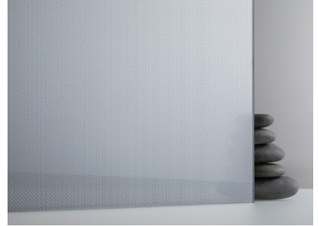
POINTED TWILL™ shown in Stainless Steel