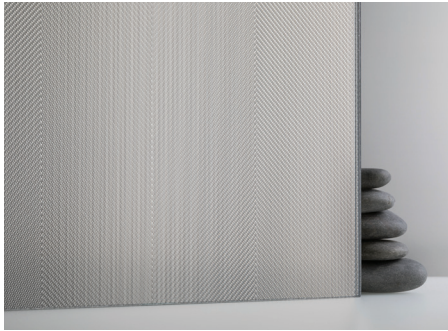
POINTED TWILL™ shown in Stainless Steel