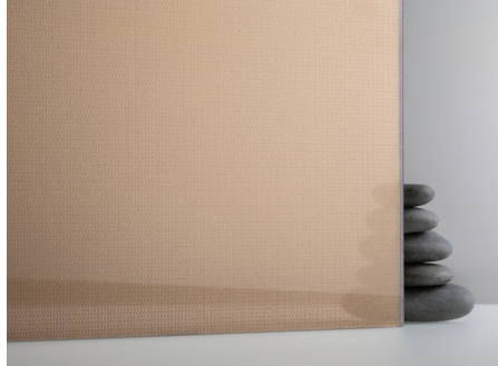
OXFORD™ shown in Nickel Bronze