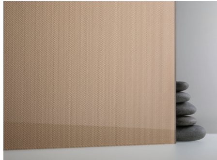
TWILL™ shown in Bronze