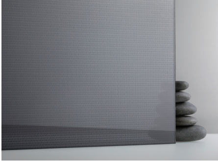
OVERLAY™ shown in Nickel Silver