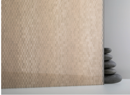
FRAMEWORK™ shown in White Gold