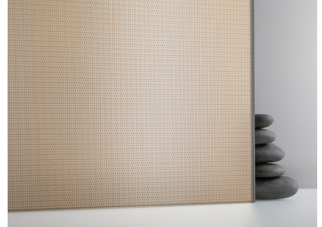
OXFORD™ shown in Nickel Bronze