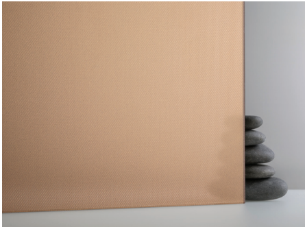
TWILL™ shown in Bronze