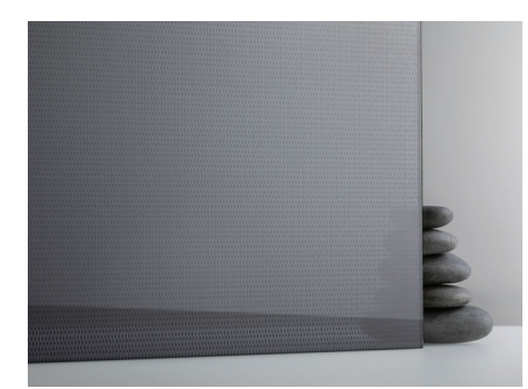
OVERLAY<sup>™</sup> shown in Nickel Silver