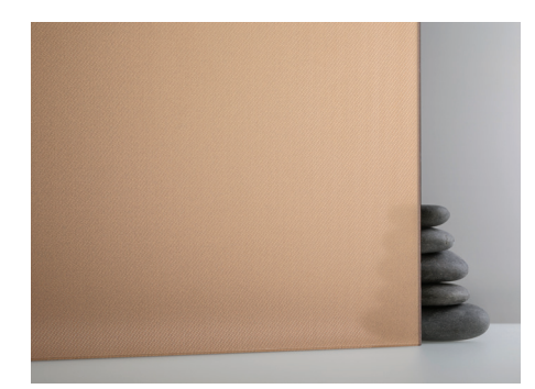
TWILL<sup>™</sup> shown in Bronze