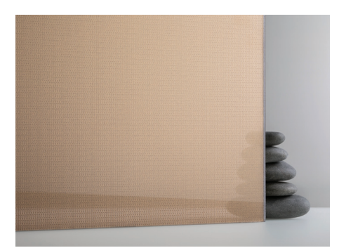
OXFORD<sup>™</sup> shown in Nickel Bronze