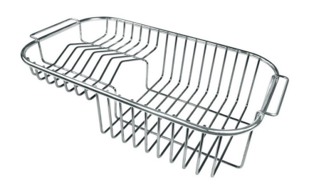
Stainless steel plate rack 8100 301