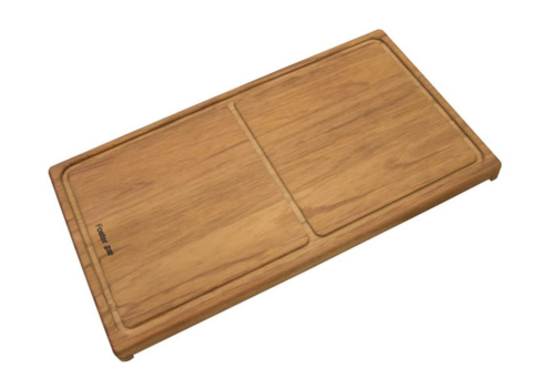
Iroko-wood sliding chopping board 8643 000