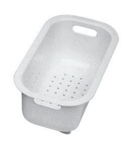
White colander 8151 100