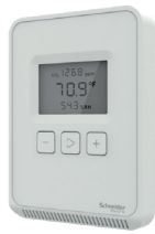
LCD with Buttons