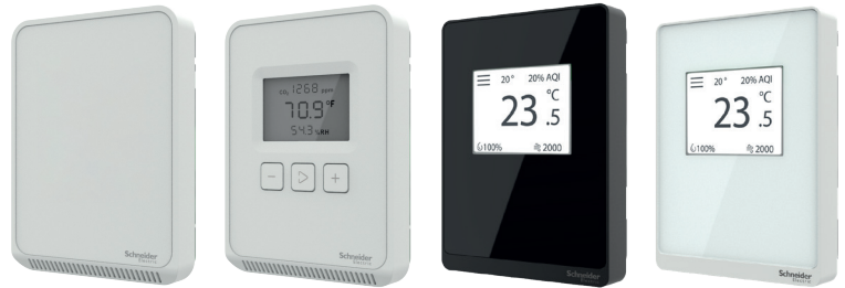
Note: A subset of models shown.