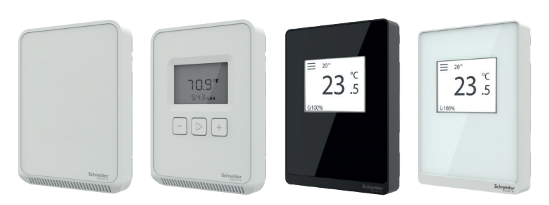
Note: A subset of models shown