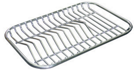
Stainless steel plate rack 8100 280