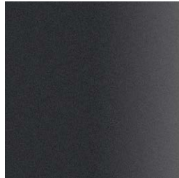
111 FT graphite fine textured