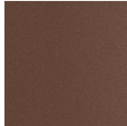
108 FT oxide fine textured