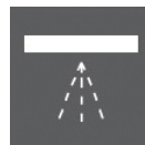
Shower head mounted atomizers