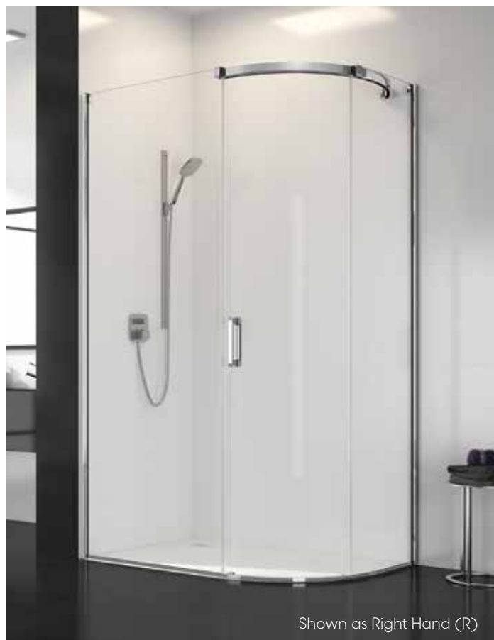
Shown as Right Hand (R)