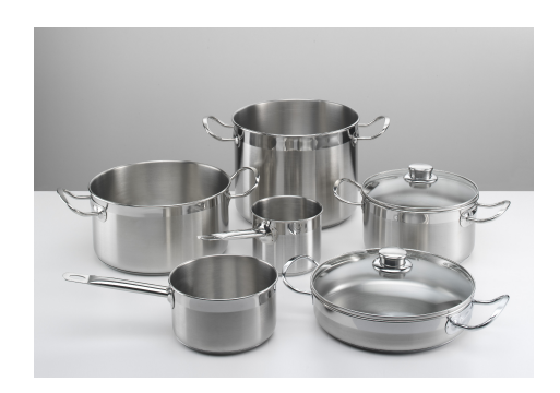
Induction Pro - Cookware set -8pcs 8210 008