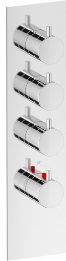
Plate and handles trimkit