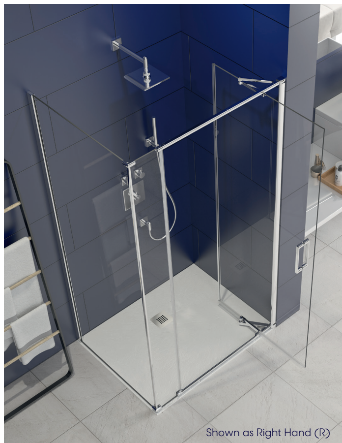
Shown as Right Hand (R)