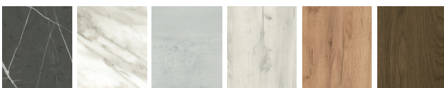
Grey stone White marble Cement Artic Oak African Oak Havana Oak