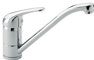
Mixer Tap S1000 - RO 8443 002