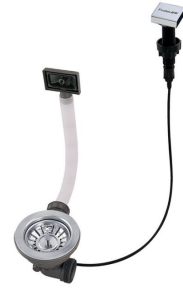
LIRA automatic waste fitting 8407 102