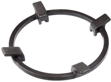
Cast iron wok support 9601 727