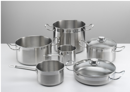
Induction Pro - Cookware set - 8pcs 8210 008