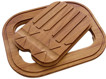
Iroko-wood twin chopping board 8644 003