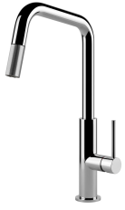
Mixer Tap KS Plus 8522 000