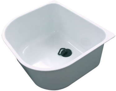
Vaschetta bianca 8152 100