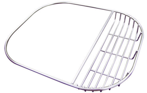
Stainless steel bowl-holder ring 8100 112