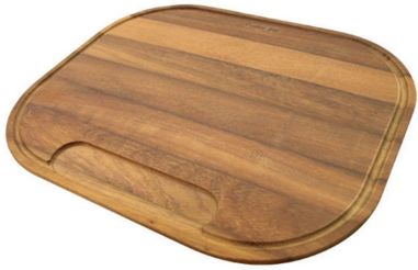
Iroko-wood chopping board 8659 112