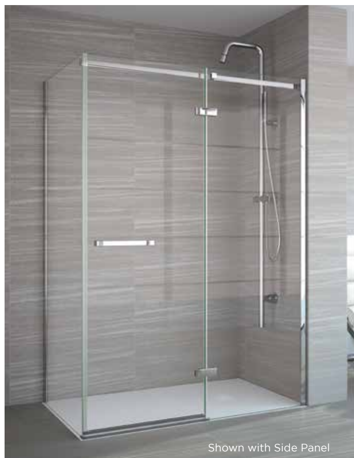
Shown with Side Panel