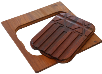
Iroko-wood twin chopping board 8644 004