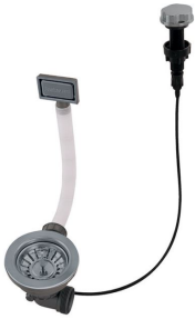
Gun Metal automatic waste fitting 8407 110