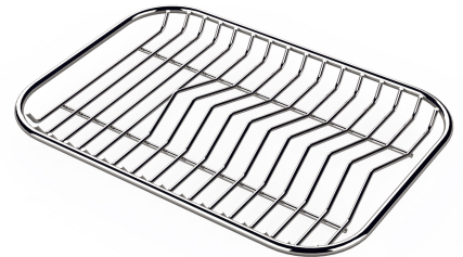
Stainless steel plate rack 8100 154