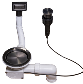
Space Push Gun Metal automatic waste fitting 8407 120