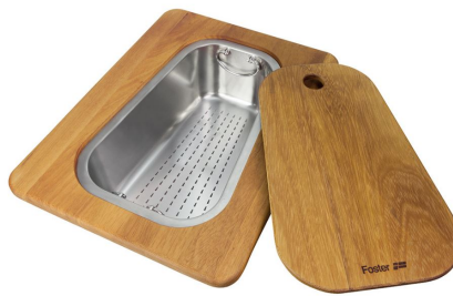
Iroko-wood chopping board with stainless steel colander 8644 042