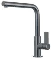
Mixer Tap Omega Gun Metal 8497 856