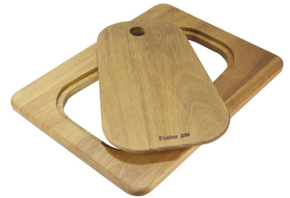
Iroko-wood sliding chopping board 8644 041