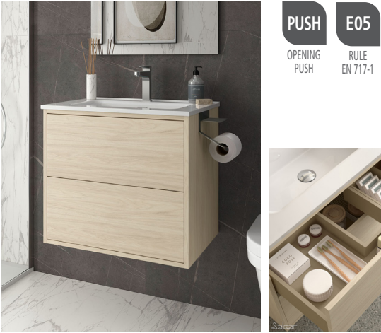
Top drawer organizer included in the cabinet.