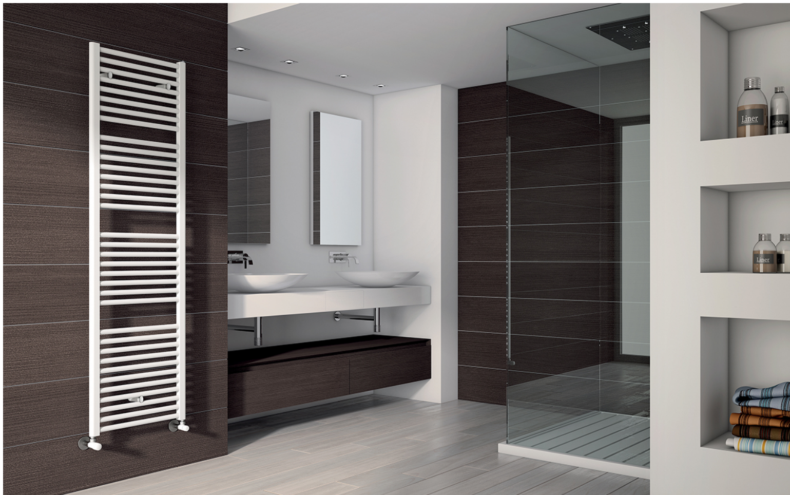
Ares, altezza 1720 mm, larghezza 530 mm, Bianco Standard

Ares grazie alla linea discreta ed elegante, si inserisce perfettamente in qualsiasi tipo di arredamento. Praticità ed affidabilità completano Ares. Disponibile solo nella versione Bianco Standard, in 4 altezze e 5 larghezze da 430 a 730 mm, anche nella versione con attacchi 50 mm. Con l'inserimento della resistenza elettrica (optional) può funzionare anche nei periodi in cui l'impianto è spento.