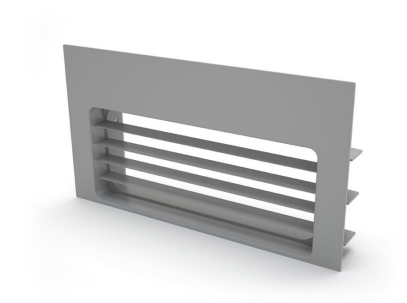
Grid for plinth gray color 9700 539