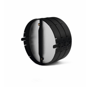
No-return valve 9700 538