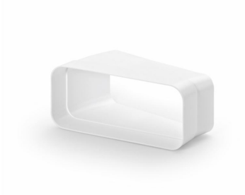
Horizontal 15° Corner connector - rectangular section 9700 536