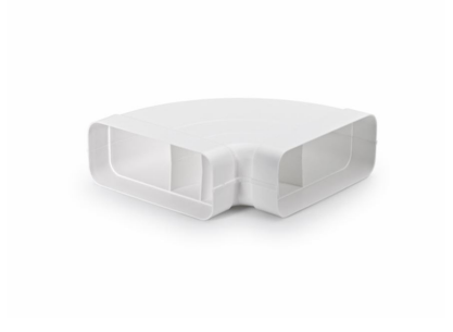
White Horizontal 90° Corner connector - rectangular section 9700 534