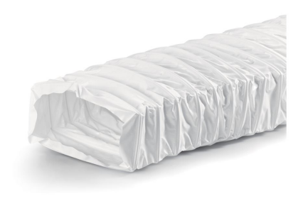
White flexible tube with rectangular section 2541 000