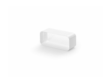
White connector - rectangular section 9700 533