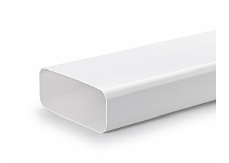
White tube - rectangular section 9700 532