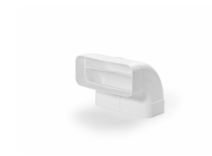
White Vertical 90° Corner connector - rectangular section 9700 535