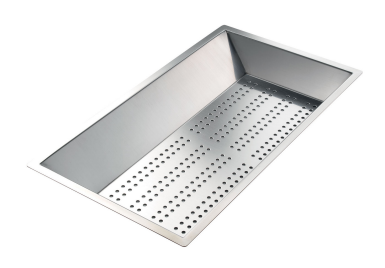
Stainless steel perforated tray 8151 000