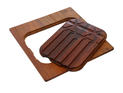
Iroko-wood twin chopping board 8644 004