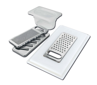
Graters kit with ring-holder and food collection tray 8159 101