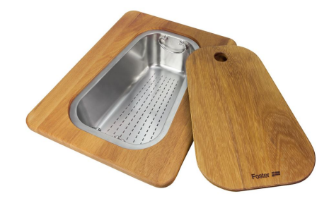
Iroko-wood chopping board with stainless steel colander 8644 042