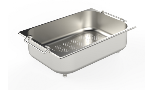
Stainless steel colander 8154 000