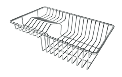
Stainless steel plate rack 8100 303