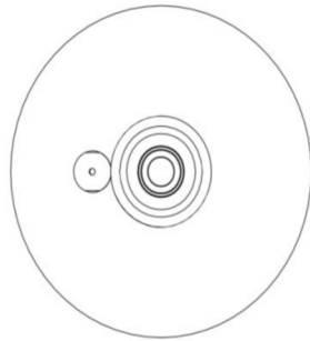
TOP VIEW SCALE: 3"=1'-0"

.25 Ceiling Mounted 8" Shower Rose, Arm and Flange