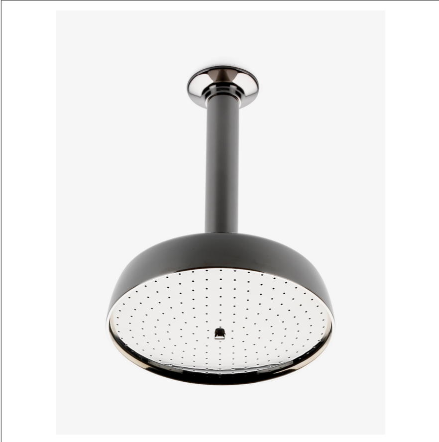
SHOWN IN .25 CEILING MOUNTED 8" SHOWER ROSE, ARM AND FLANGE| PTSH72

.25 Ceiling Mounted 8" Shower Rose, Arm and Flange