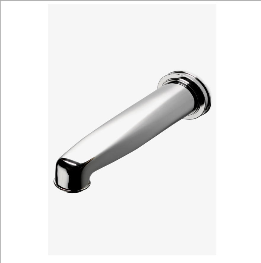
SHOWN IN AERO WALL MOUNTED TUB SPOUT | AETS82