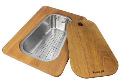
Iroko-wood chopping board with stainless steel colander 8644 042