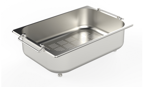
Stainless steel colander 8154 000