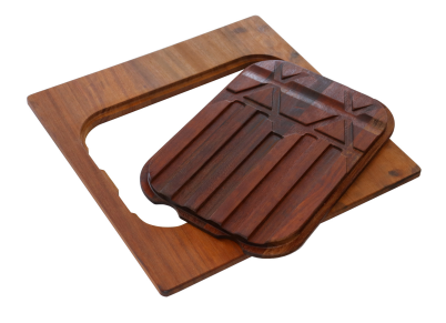
Iroko-wood twin chopping board 8644 004