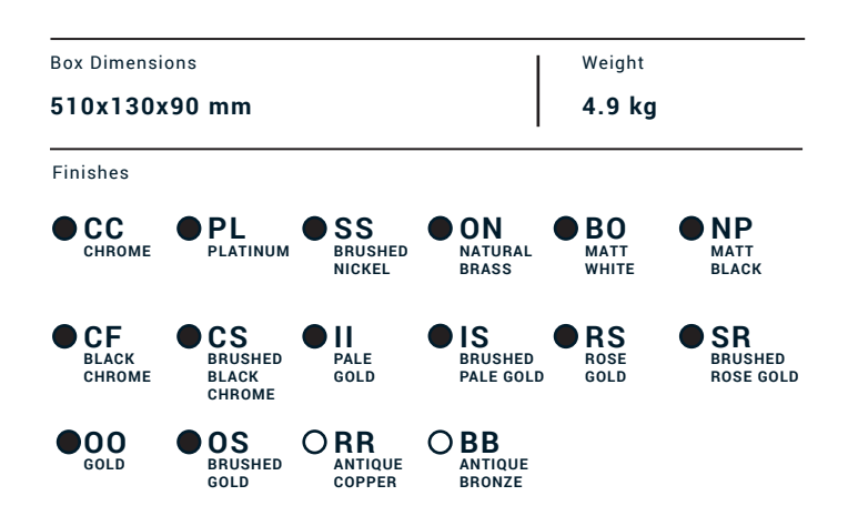
Plate and handles trimkit