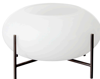
Opal / Bronzed Brass