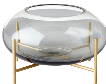
Smoke / Brushed Brass