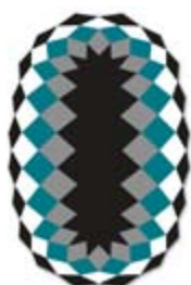
Black-Green/ Negro-Verde REF: 62049