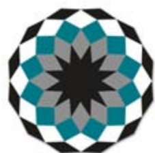
Black-Green/ Negro-Verde REF: 62049