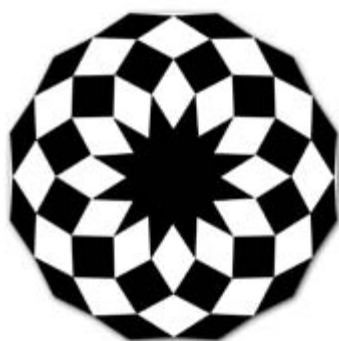
Black - White / Negro - Blanco REF: 62021