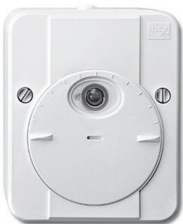
ARGUS light-sensitive switch AC 230 V, original product size

The ARGUS light-sensitive time switch allows you to be particularly energyefficient, wherever you need light to be maintained for a certain period of time. For example: on company premises, in car parks and petrol stations, in front of galleries and shop windows or for path lighting.