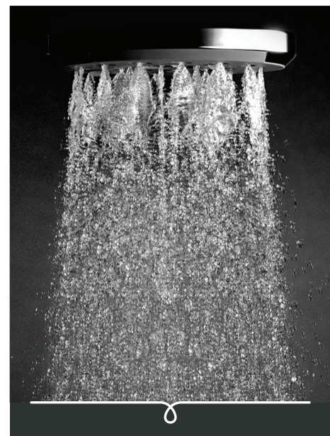
Satinjet<sup>®</sup>. The unmistakable feeling of 300,000 droplets per second.

Unlike conventional showers, Satinjet uses unique twin-jet technology to create optimum water droplet size and pressure, with over 300,000 droplets per second providing greater warmth and coverage. The result is an immersive, full-body experience.