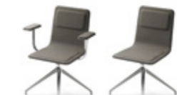
LAIA MEETING CHAIR 4 fixed legs in matt chromed metal, revolving seat. Seat in plywood upholstered in fabric, eco-leather and leather. Natural felt back Seat : H 480 mm H 840 x L 510 x W 540 mm Armrest in option