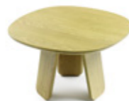
TRIKU COFFEE TABLE Solid oak construction, top in solid oak, 3ply, 26mm. H 380 x L 650 x W 650 mm