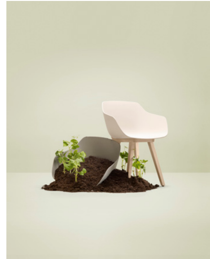
Kuskoa Bi: A Bioplastic Chair P.80