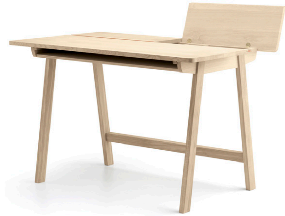
LANDA DESK DESIGNED BY SAMUEL ACCOCEBERRY