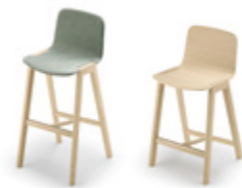
HELDU HIGH BACKREST STOOLS Solid oak structure. Two finishes: oak veneer 2 faces or fully upholstered in fabric, leather or eco-leather. Foot rest with stainless edge. Seat: 800 mm H 1060 x L 490 x W 530 mm Seat: 660 mm H 910 x L 490 x W 530 mm