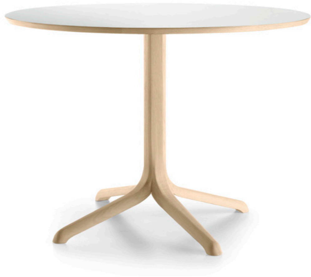
JANTZI ROUND DESIGNED BY SAMUEL ACCOCEBERRY