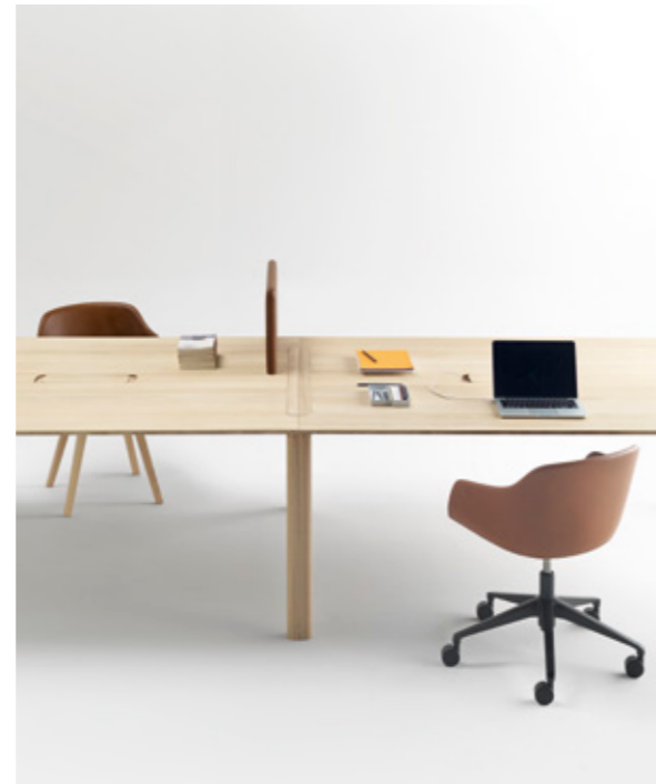
Heldu: Bringing warmth to the office. P.44