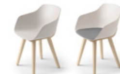
KUSKOO BI MEETING CHAIR Solid oak structure. Bioplastic shell or pad seat (fabric, eco leather or leather). Legs available Seat : H 460 mm H 800X L595 x W 530 mm