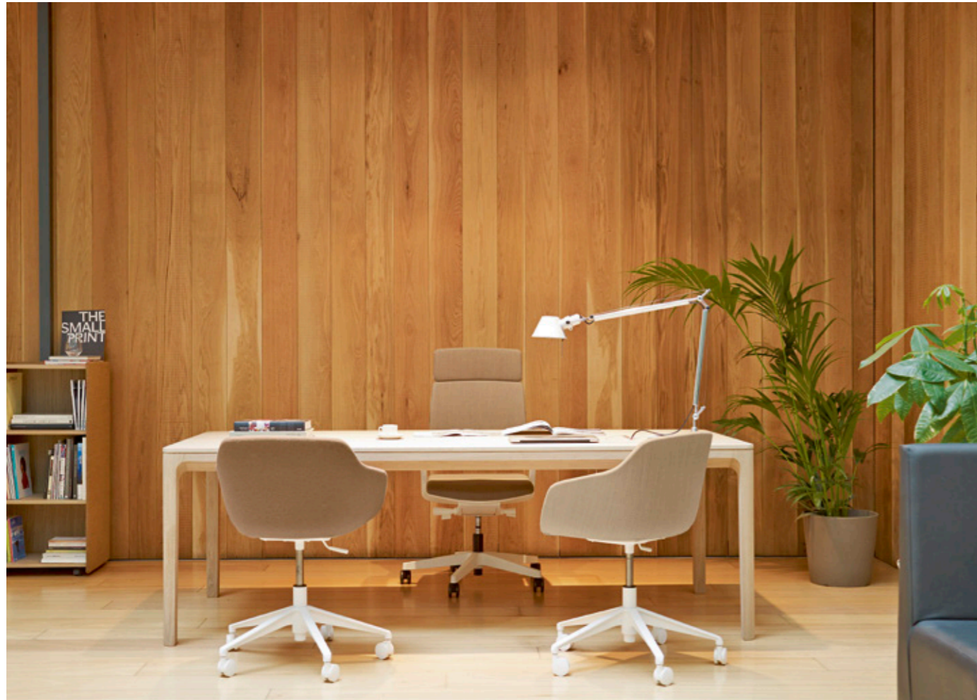
LAIA TABLE WITH KUSKOA BI CHAIRS DESIGNED BY IRATZOKI LIZASO