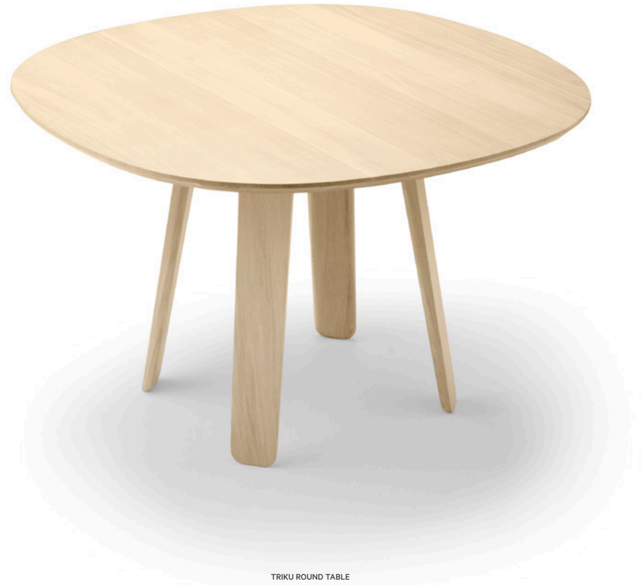
TRIKU ROUND TABLE DESIGNED BY SAMUEL ACCOCEBERRY