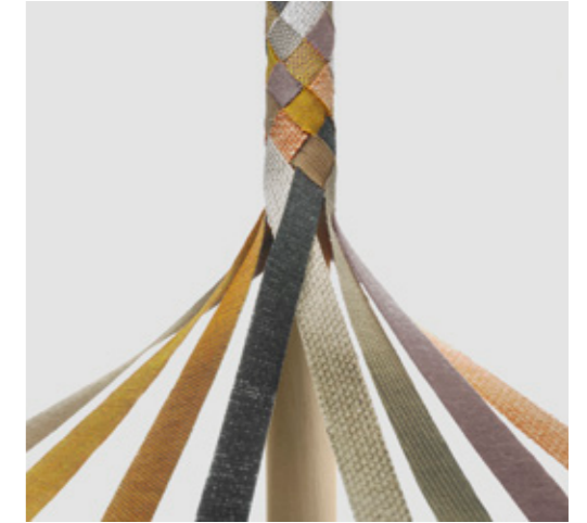
Colour & Materials P.102