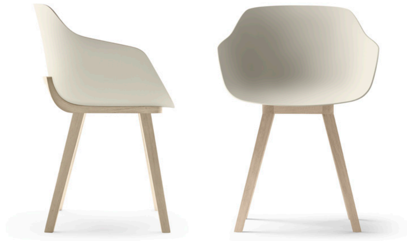
KUSKOA BI LEFT: ULPHOSTERED IN BLACK LEATHER RIGHT: WHITE BIOPLASTIC SHELL