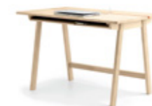
LANDA Solid oak structure. Top 21mm multi-ply + 4 underpads massive cuts miter, oak veneer (1 mm ), 2 faces. Interior distribution. Black or red brush. Oak boxes (option). H 753 x L 1200 x W 705 mm H 753 x L 1500 x W 800 mm H 753 x L 1800 x W 950 mm