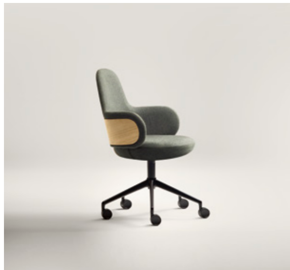
Work in progress. Alki's upcoming task Chair P.64