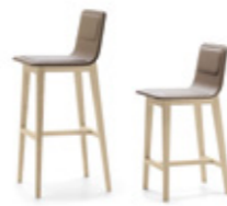
LAIA HIGH BACK STOOLS Solid oak structure. Seat in plywood. Upholstered in fabric, eco leather or leather and natural felt (4mm thickness). Foot rest with stainless edge. Seat: 800 mm H 1080 x L 400 x W 500 mm Seat: 660 mm H 940 x L 400 x W 480 mm