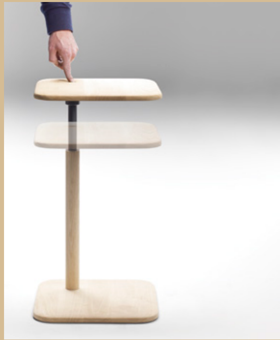
This side table integrate an height adjustment system and can be used as support for digital devices or just as a coffee table.