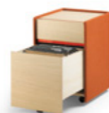
LANDA 2 DRAWERS (ON WHEELS) Structure beech covered with fabric. Drawers: interior beech, exterior oak. Made of roller bearings in total output. Top: multi-ply oak. Black or red brush. One drawer for suspended folder. H 580 x L 420 x W 445 mm