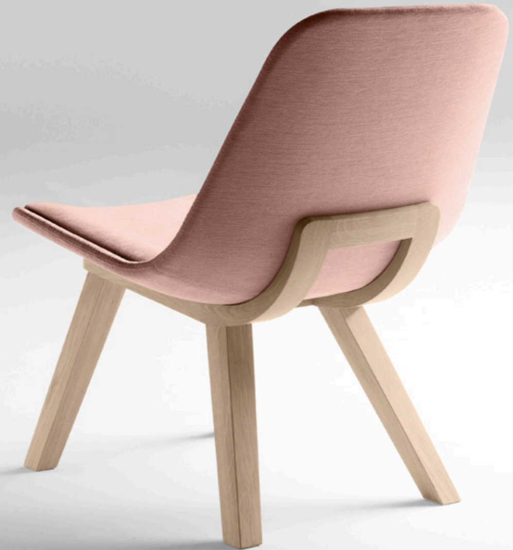
KUSKOA LOUNGE DESIGNED BY JEAN LOUIS IRATZOKI

Solid oak structure. Back and seat in high density foam upholstered in fabric, leather or eco leather. Seat: H 410 mm H 760 x L 760 x W 800 mm