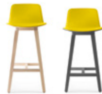
KUSKOA STOOLS Solid oak structure. Shell in oak, "valsain" sandy finish; or back in oak, face covered with fabric or leather; or shell covered in fabric or leather. Foot rest with stainless edge. Seat: 800 mm H 1000 x L 410 x W 480 mm Seat: 660 mm H 860 x L 410 x W 480 mm