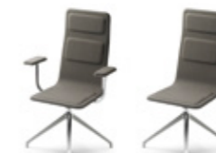
LAIA HIGH BACK MEETING CHAIR 4 fixed legs in matt chromed metal, revolving seat. Seat in plywood upholstered in fabric, eco-leather and leather. Natural felt back Seat : H 480 mm H 970 x L 510 x W 540 mm Armrest in option