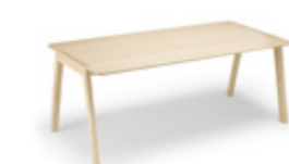
HELDU RECTANGULAR TABLE Solid oak structure. Top : solid oak (3 ply, 22 mm thickness) or laminated. H 760 x L 750 x W 850 mm H 760 x L 1300 x W 850 mm H 760 x L 1900 x W 1000 mm H 760 x L 2400 x W 1000 mm