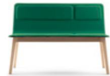
LAIA HIGH BACK Solid oak structure. Seat front in fabric, leather or eco-leather. Natural felt backing. Seat: H 460 mm H 820 x L 1180 x W 520 mm