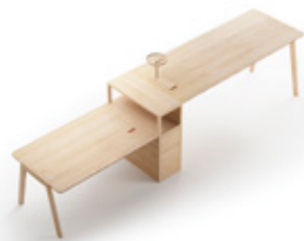
HELDU (1140mm & 760mm) Tables: Solid oak structure, solid oak top (3 ply, 22 mm thickness) Drawers and panels : oak veneer/particle board. Inside drawer. High Table: H 1140 x L 1565 or 2450 x W 1000 mm Container: H 1140 x L 400 x W 1000 Table : H760 X L 1565 or 2450 x W 1000 mm