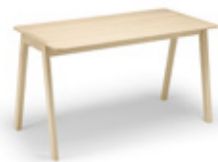
HELDU (900mm) Solid oak structure. Top: Solid oak (3 ply, 22 mm thickness) or laminated. H 900 x L 1600 x W 800 mm