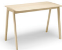
HELDU (1080mm) Solid oak structure. Top: Solid oak (3 ply, 22 mm thickness) or laminated. H 1080 x L 1600 x W 800 mm