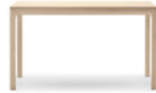
LAIA (900mm) Solid oak legs. Top in 16mm multi-ply + 4 underpads massive cuts miter, oak veneer (1mm) 2 sides. H 900 x L 1300 x W 1300 mm H 900 x L 1600 x W 700 mm H 900 x L 2300 x W 700 mm.