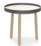
EGON COFFEE TABLE Solid oak legs. Solid oak top, 3 ply, 21 mm thickness and wrought iron. H 430 x Ø 460 mm