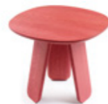
TRIKU COFFEE TABLE Solid oak construction, top in solid oak, 3ply, 26mm. H 440 x L 540 x W 540 mm