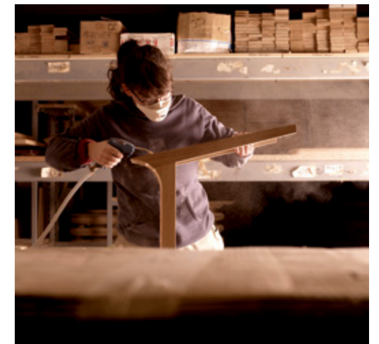
About Us P.114