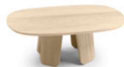
TRIKU COFFEE TABLE Solid oak construction, top in solid oak, 3ply, 26mm. H 340 x L 900 x W 550 mm