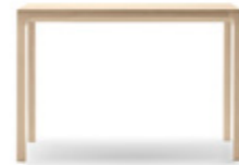
LAIA (1080mm) Solid oak legs. Top in 16mm multi-ply + 4 underpads massive cuts miter, oak veneer (1mm) 2 sides. H 1080 x L 1300 x W 1300 mm H 1080 x L 1600 x W 700 mm H 1080 x L 2300 x W 700 mm