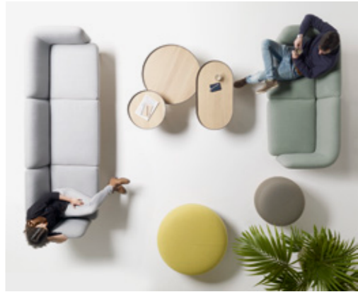
The Egon Lounge Collection P.19

Alki team is engaged daily in their values - cooperative culture, know-how, design and manufacturing in the Basque country. Our values are represented in products and materials, colours and manufacturing that we are using. The following few articles illustrate our research into the working environment.