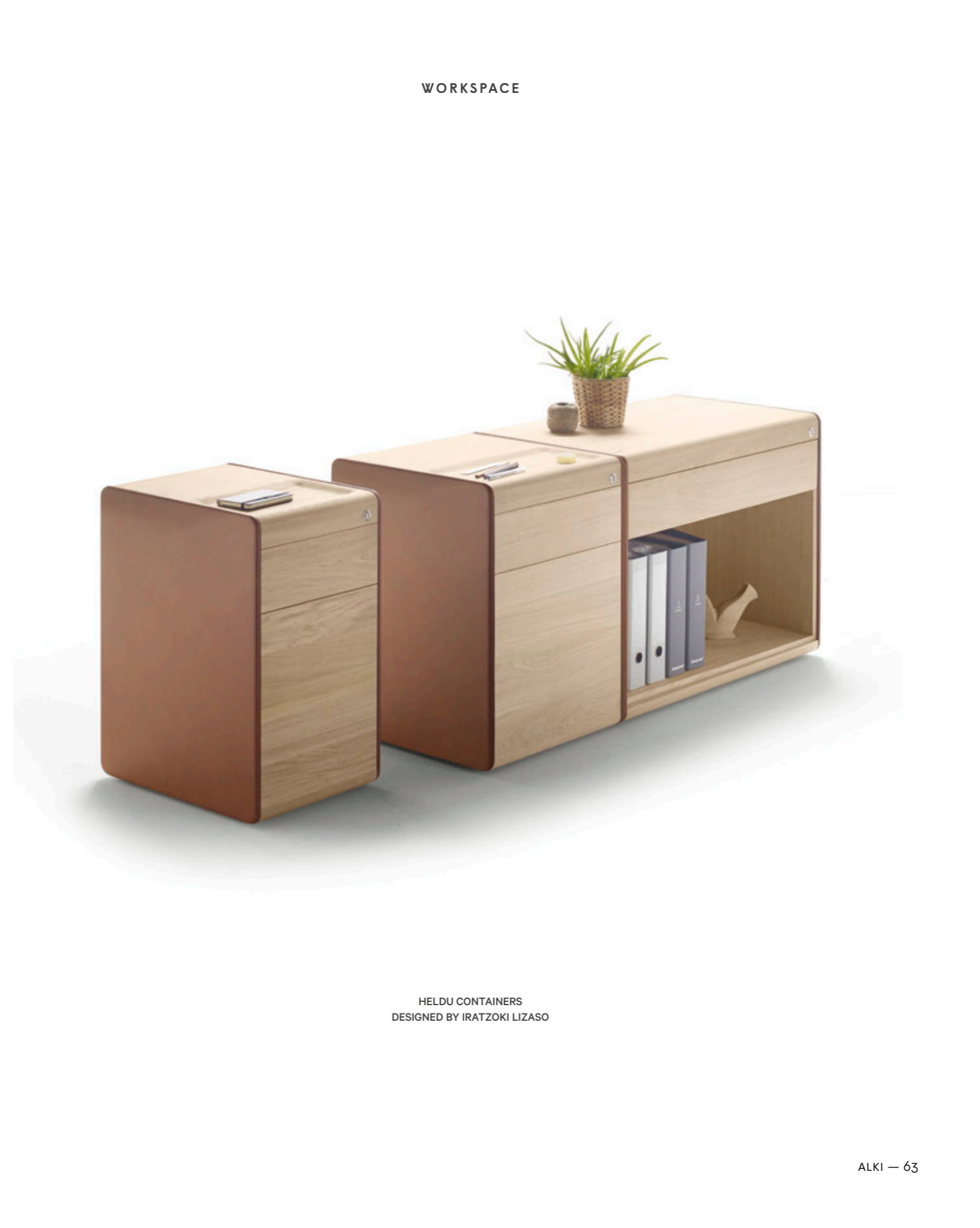
HELDU CONTAINERS DESIGNED BY IRATZOKI LIZASO