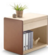
HELDU 1 DRAWER (ON WHEELS) Top in solid oak. Structure beech veneered with fabric, eco leather or leather. Lockable. H 650 x L 480 x P 500 mm H 650 x L 850 x P 500 mm,