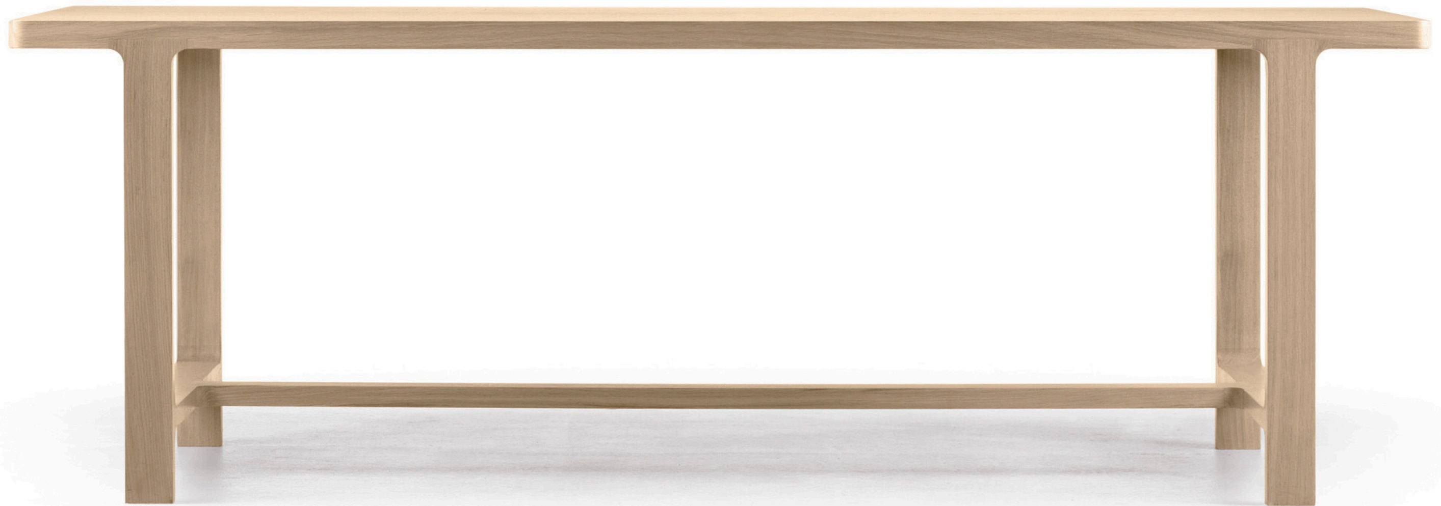
EMEA MEETING TABLE DESIGNED BY JEAN LOUIS IRATZOKI