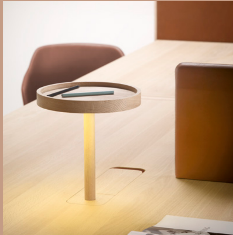
The table lamp doubles up as a small tray made out of solid wood. The light can be turned on and off with a gesture thanks to an integrated motion detector.